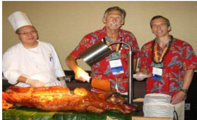
Pig Roast – Compliments of Berks County Dental Society PDA delegates assist the chef.

Our Success is based on Our Relationships!