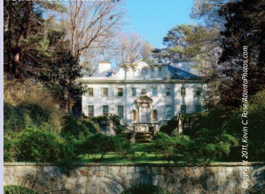
Swan House Mansion