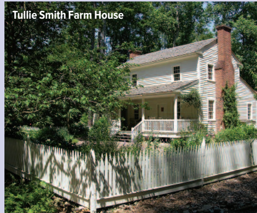
Tullie Smith Farm House