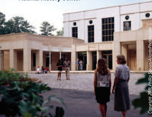
Atlanta History Center